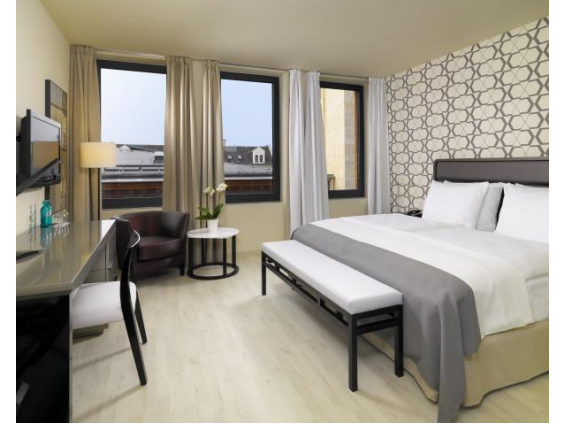
Deluxe Double Room