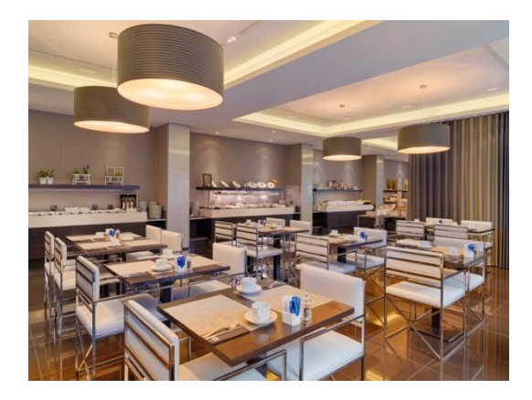
Restaurant "Salt & Pepper"

Our restaurant "Salt & Pepper" with a mix of delicate Mediterranean and international food, our bar at the lobby, our business centre and an underground garage complete our offer. Our charming typical Berlin terrace is perfectly suited for smaller events.